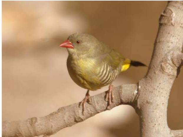
Green Avadavat

Before starting to climb up to Mount Abu Ranbir called a halt when he spotted three Indian Coursers not far from the road; we also had six Yellow-wattled Lapwings on the journey.