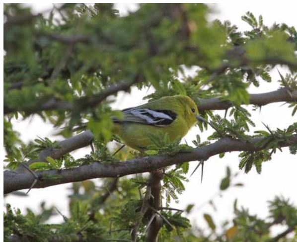
Marshall's lora

As well as the lack of beer etc we had to contend with strict vegetarian food at CEDO. Not even any eggs until we pleaded for them.