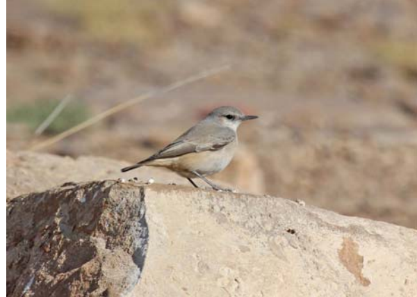
Red-tailed Wheatear

Only about 6km along the road to Jaisalmer we pulled off onto a large bare area with a few small rocky hills. Here we saw two Desert Larks on the edge of their range, two Red-tailed Wheatears , a fly-over Hoopoe Lark , 13 Black-bellied Sandgrouse and a male Pallid Harrier.