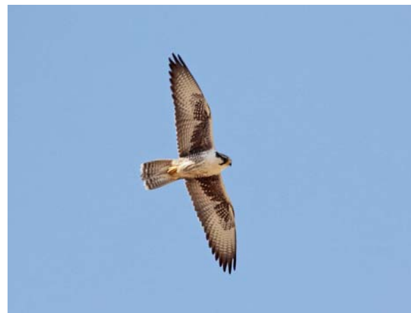
Laggar Falcon

Early breakfast just as it was getting light and then away for a full day in Desert National Park . The drive there produced a perched Laggar Falcon – the first of at least three during the day. Arriving at the park entrance we were pleased that the checking-in process was quick and easy, unlike the previous system that involved a day traipsing around Jaisalmer. And it turned out we were the only people in the park all day.