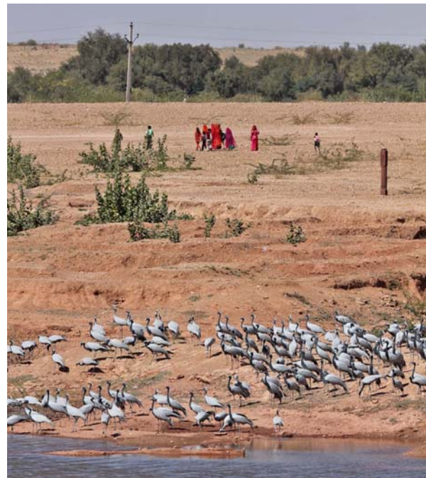
Demoiselle Cranes, Kheecan