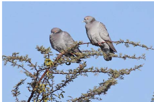
Yellow-eyed Pigeon

After an all-too-short hour or so at the dump we had to move on. Next stop was the famous village of Kheechan where locals feed thousands of Demoiselle Cranes . Early morning is best, but it was not possible to fit this into our busy