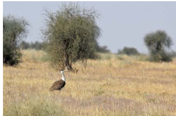
Great Indian Bustard

We transferred from our minibus to two wooden camel carts that were to be our base for the day. This worked well, as the two guys who led the camels knew where to go and seemed to have excellent eyesight. They soon found us one of the big targets, Great Indian Bustard – at least ten including six males together. They were quite wary but the guides manoeuvred the carts well so as to give us good views.