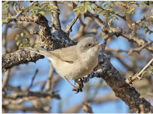
Minula Lesser Whitethroat

The afternoon session was a visit to a different wetland, Vanod. Here views were not as good as at yesterday's site as we were very much on the edge. However we did see seven Sarus Cranes, a fulvescens Greater Spotted Eagle, and, on a field nearby, two Sociable Plovers . Numbers of the plovers vary from year to year and this was a poor one.