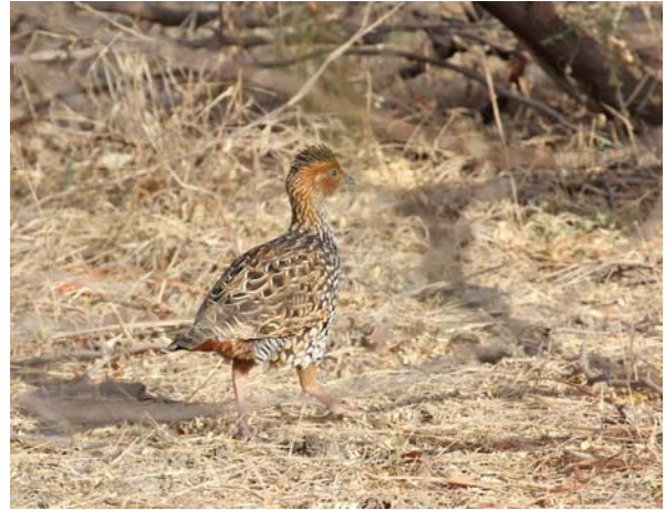
Painted Francolin

We saw two Striped Hyenas mating, half-hidden by long grass. Also two Indian Eagle-Owls that our guide disturbed from their roost in a large tree by the old park guesthouse, allowing us to see them sat in the grass. After that he was all for packing in and taking us back to the lodge by about