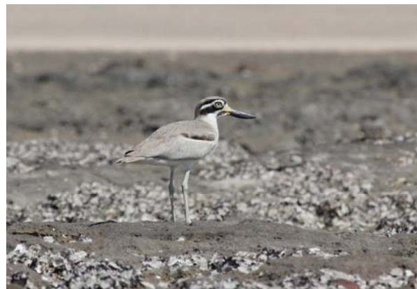
Great Thick-knee

Day 12 = Thursday February 16 th An early start for a trip to the Gujarat coast. Our first stop was at a river mouth in Mandvi: small numbers of waders but nothing to get excited about. Then on to the very extensive beach and mudflats at Modhva, 15 km from Mandvi. This was superb, with large numbers of a variety of birds. The main targets were Crab Plover , of which we saw at least 26, and Great Thick-knee , three.