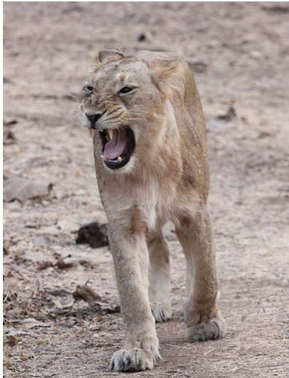
Asiatic Lion

ten Asiatic Lions , one a superb roaring male that we had all to our selves. Birdwise highlights were a male White-bellied Minivet for one jeep and a perched Grey Nightjar.