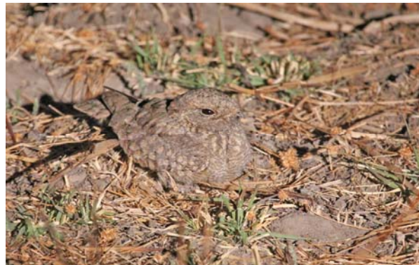
Sykes's Nightjar