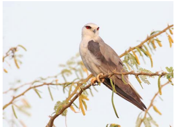
Black-shouldered Kite

0900 but we eventually convinced Ranbir and then him that this was not what we wanted and instead we visited the wetland area until 1020. We saw more Black-shouldered Kite and an adult Indian Spotted Eagle soaring quite close to us convinced even Richard, and a juvenile Lesser Flamingo seemed a bit out of place. After plenty of time to relax, pack and have lunch we set off on our final drive, to the airport at Ahmedabad, mid-afternoon. The route soon joined quite busy main roads and we had few opportunities to stop. The only birds of note were 12 Sarus Cranes and very large numbers of Rose-coloured Starlings.