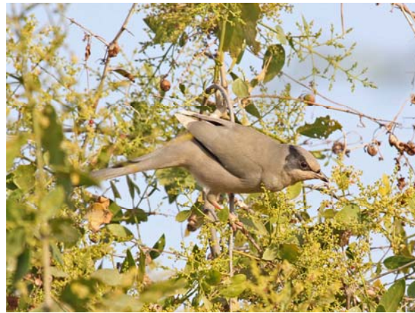
Grey Hypocolius

Despite it being a new bird for most of us it was a bit of an anticlimax as everything was so orchestrated and Jugal had guaranteed us success. Glimpses of Indian Eagle Owl and Sirkeer Malkoha were all else of note. We had breakfast near a large rock-pile in an open area, the rocks being frequented by a Red-tailed Wheatear. The rest of the day we explored several areas around Chhari village. The obvious highlight was stumbling upon a flock of ten Pale Rock Sparrows (Pale Rockfinches) . Jugal had seen a much larger flock a few km away two or three weeks earlier but these are the first records for the Indian subcontinent of what is essentially a Middle Eastern bird. We also saw an Asian Desert Warbler, a Booted Eagle, a few Alpine Swifts (scarce locally), a Stoliczka's Bushchat and a Grey-necked Bunting. And we heard a Water Rail in a reedbed, very scarce locally.