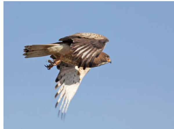
White-eyed Buzzard © R F Porter

It was again after dark when we arrived at our accommodation, the wonderful Fort Chanwa at Luni.