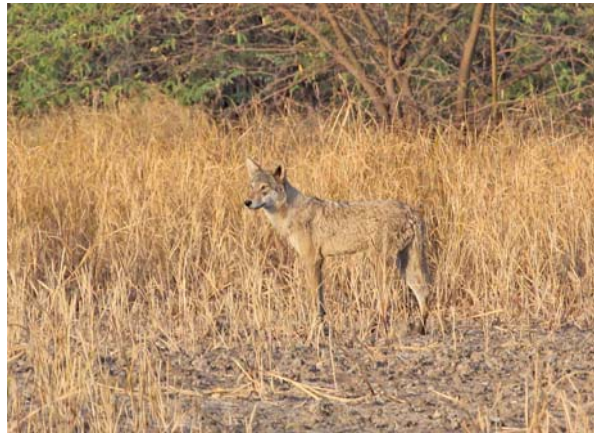
Indian Grey Wolf

Our afternoon drive started at 1600, with the elderly guide. The obvious highlights were mammalian, with six Wolves (two loping across the plain and then a female with three large cubs) and a Striped Hyena . The only new bird of note was a male Painted Francolin .