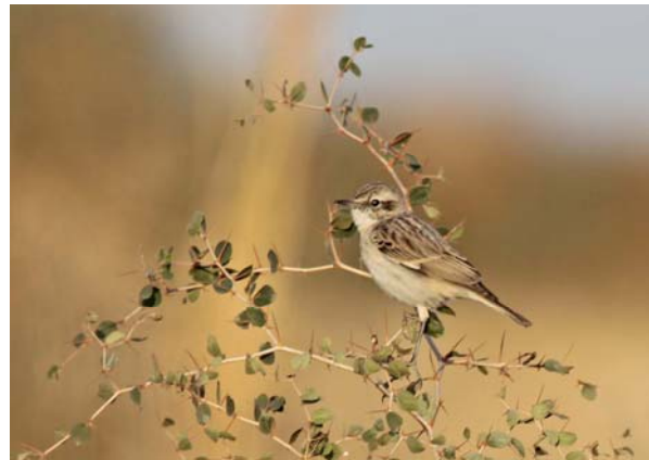
Stoliczka's Bushchat

Day 12 = Thursday February 16 th An early start for a trip to the Gujarat coast. Our first stop was at a river mouth in Mandvi: small numbers of waders but nothing to get excited about. Then on to the very extensive beach and mudflats at Modhva, 15 km from Mandvi. This was superb, with large numbers of a variety of birds. The main targets were Crab Plover , of which we saw at least 26, and Great Thick-knee , three.