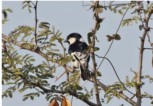
White-naped Tit

Day 10 = Tuesday February 14 th Transfer from the Little Rann to the Great Rann. On the way we passed a large area of saltpans where we counted 32 grey Western Reef-Egrets along one side of the road – how many white ones there were is anyone's guess. Not much else on the journey except a field with 14 Indian Coursers. We arrived at Jugal Tiwari's CEDO (Centre for Estuary and Desert Studies) mid afternoon and after a short rest we set out for a scrubby area known as Fotmahadev with a local guide. In two and a half hours here we saw all but one of the four main targets: a superb White-naped Tit , three or four Marshall's loras , and a male Painted Sandgrouse . Other good birds here included ten or so Sykes's Larks, four Grey-necked Buntings, three Common Woodshrikes and two Oriental Honey Buzzards.